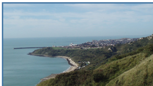
Photo: of East Wear Bay and the Warren

We aim to look at the structural geology of the cliffs at Samphire Hoe along with the engineering geology of the sea defences and construction of the Hoe. At low tide we will also look at the construction of the seawalls and other sea defences at Folkestone Warren.